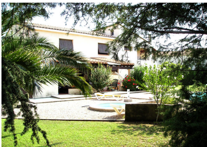
View of the garden