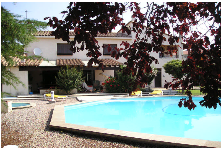
View of the pool