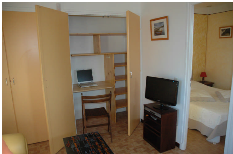
Storage and writing table ( WiFi available )