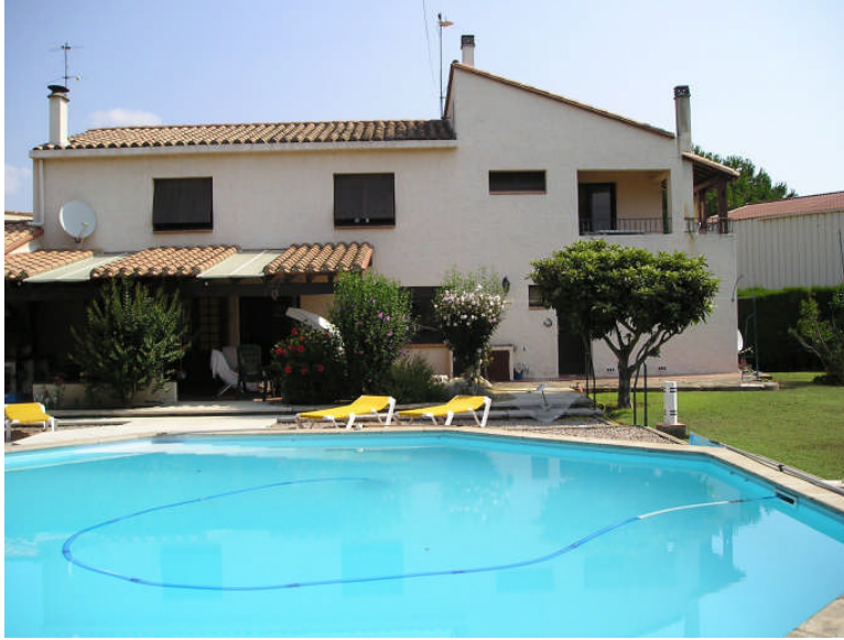
View of the Flat from the pool ( see balcony top right)