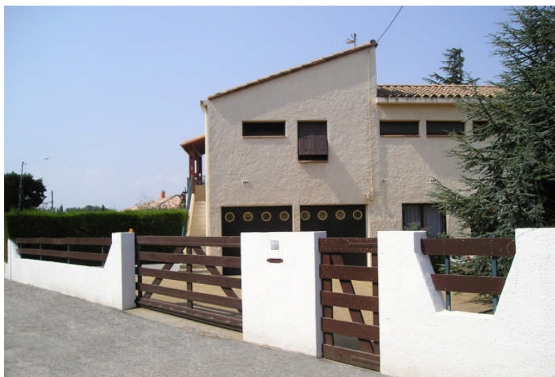
Access from the rue du Canigou